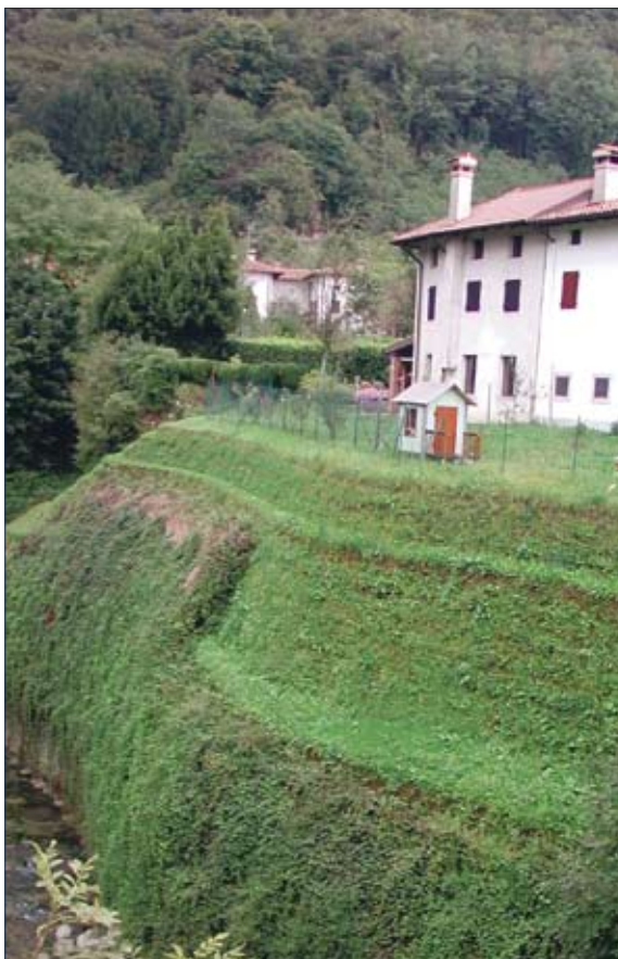
terre rinforzate / reinforced grounds