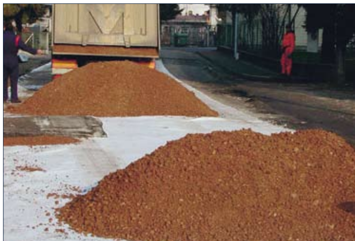
rinforzo e separazione / reinforcement and separation