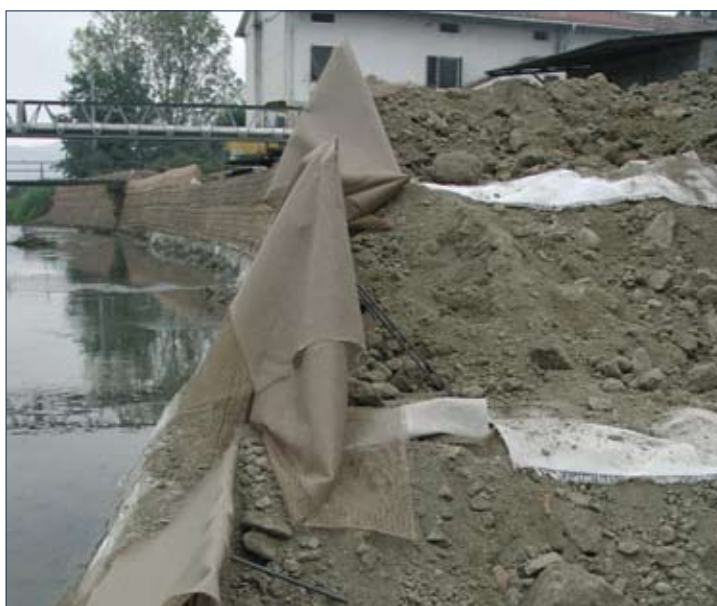
rinforzo e filtrazione / reinforcement and filtration

Alpe Adria Textil Srl reserves for itself the right to modify, without any notice, technical and aesthetic characteristics of its products based on continuous technological evolution.