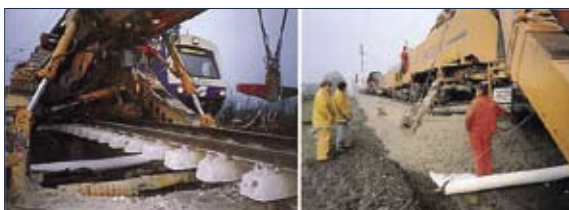
scudatura rilevato / railway topping layer