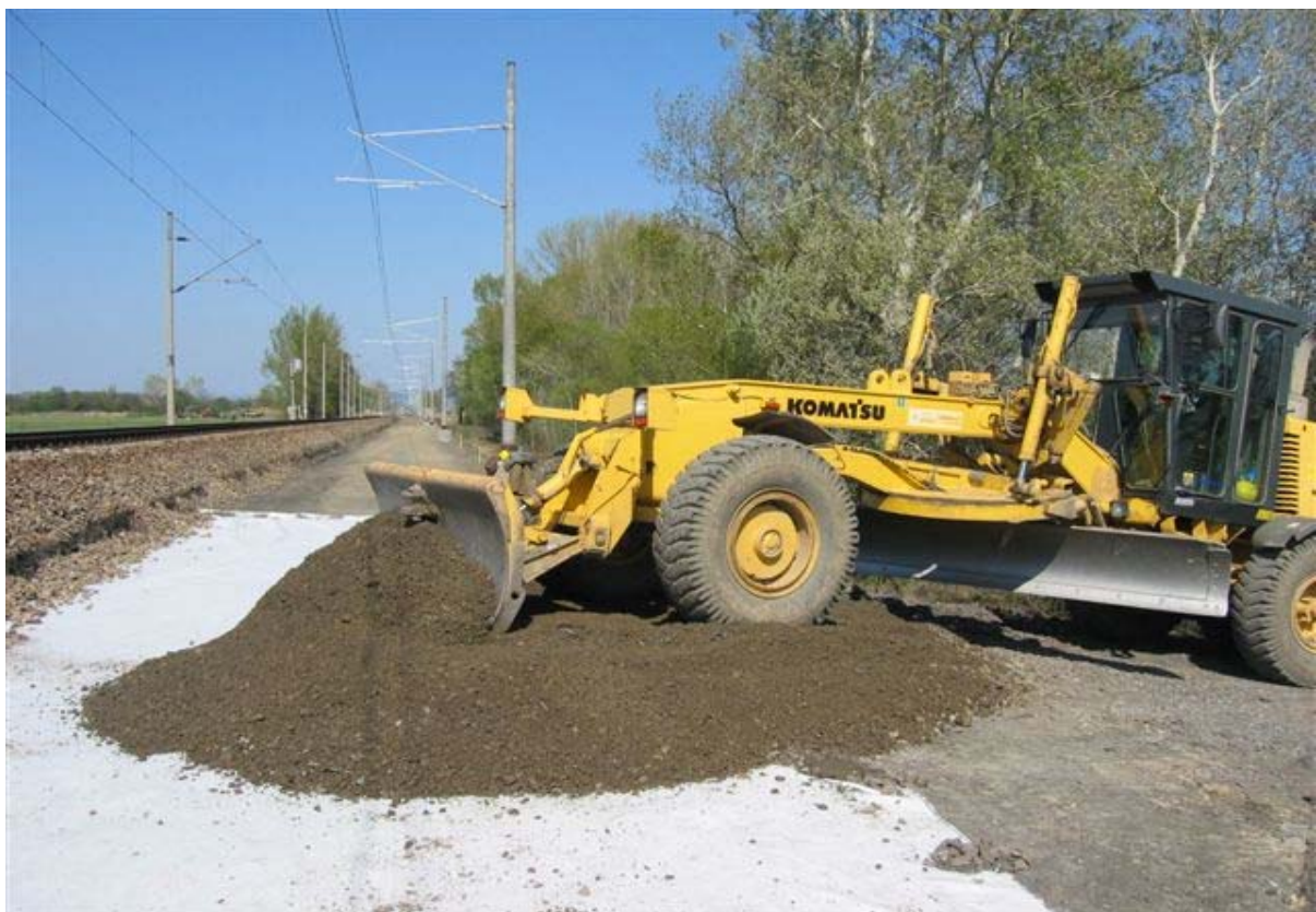
Fig. 9 Brestovany – Leopoldov, spreading the base layer of crushed gravel fraction 0 – 32 mm