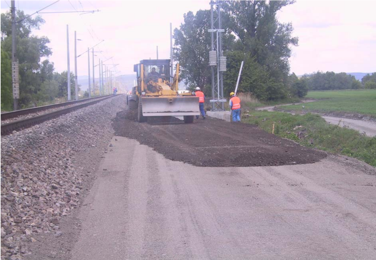
Fig. 10 Brestovany – Leopoldov, spreading the base layer of crushed gravel fraction 0 – 32 mm in second layer