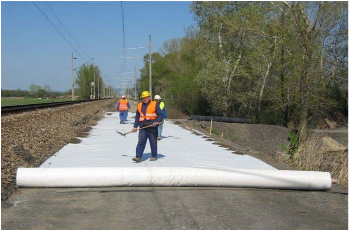
Fig. 8 Brestovany – Leopoldov, laying the MACRIT GTV 50/50 B geocomposite