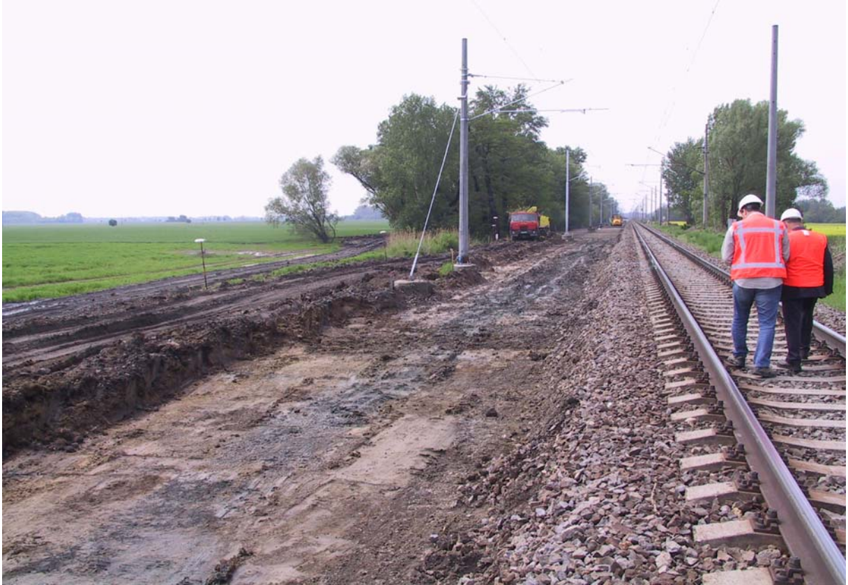
Fig. 4 Brestovany – Leopoldov, track number one, earth subgrade before reconstruction