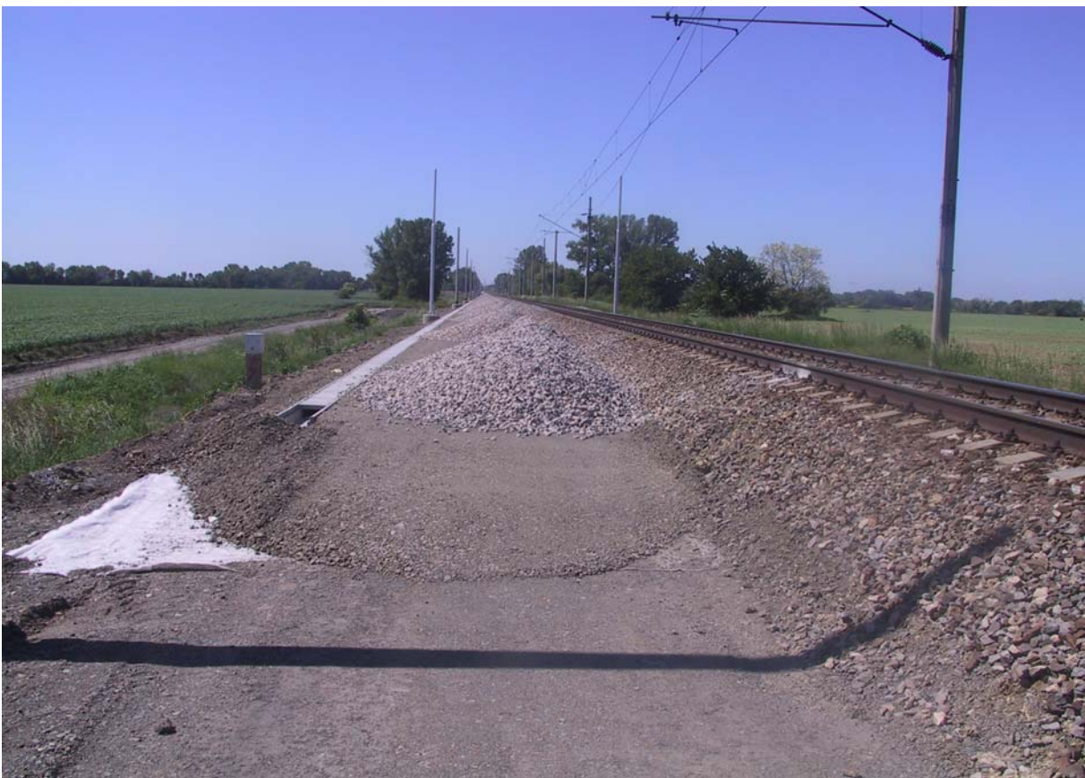
Fig. 11 Brestovany – Leopoldov, brought track bed material of fraction 32 – 63 mm