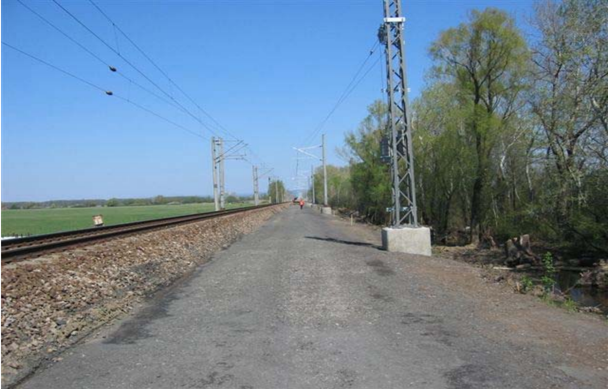
Fig. 6 Brestovany – Leopoldov, track number one, modified and compacted earth subgrade