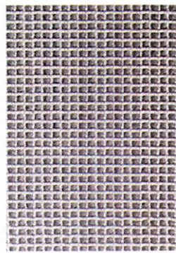
Fig. 3 The MACRIT GTV 50/50 B geocomposite

One of the advantages of using the MACRIT geocomposite is that it allows the earth subgrade to be constructed with a 3% gradient while maintaining the required properties of the earth subgrade, such as for instance good drainage. Using the 3% gradient has to a large degree reduced the volume of earthworks when excavating the railway substructure and when designing a draining trench.