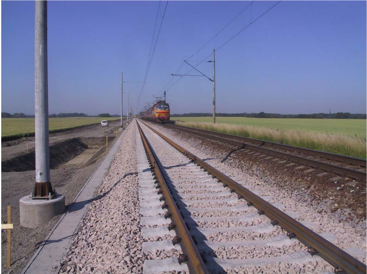
Fig. 12 Brestovany – Leopoldov, modernised section of track number one