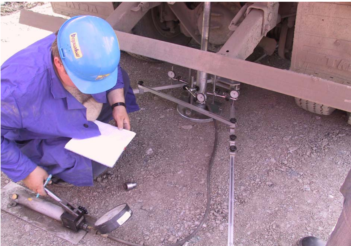
Fig. 7 Brestovany – Leopoldov, static loading test of the earth subgrade