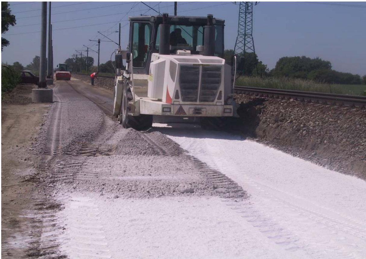
Fig. 5 Brestovany – Leopoldov, lime stabilisation of the earth subgrade