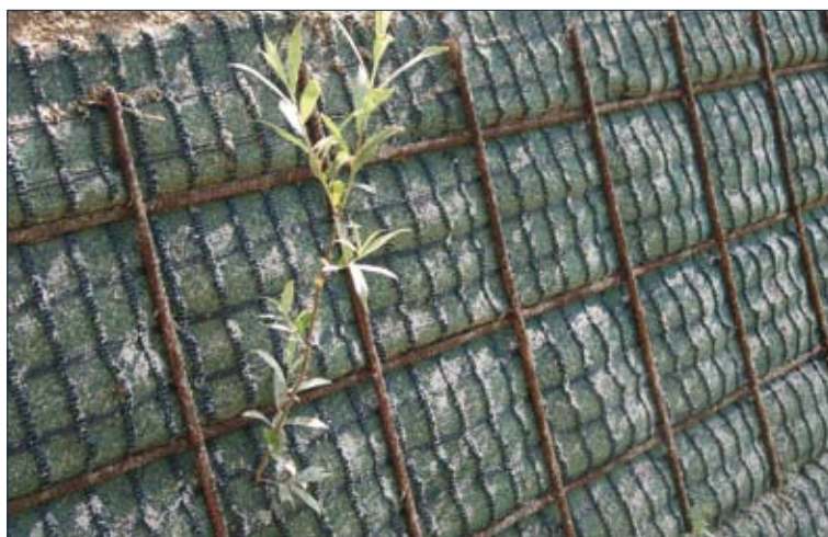
dettaglio / detail