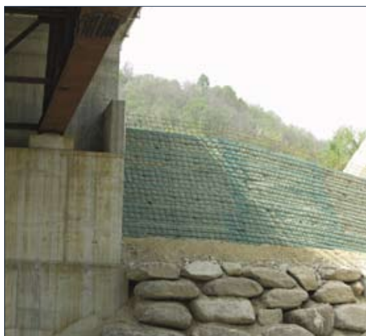
spalla di ponte / abutment